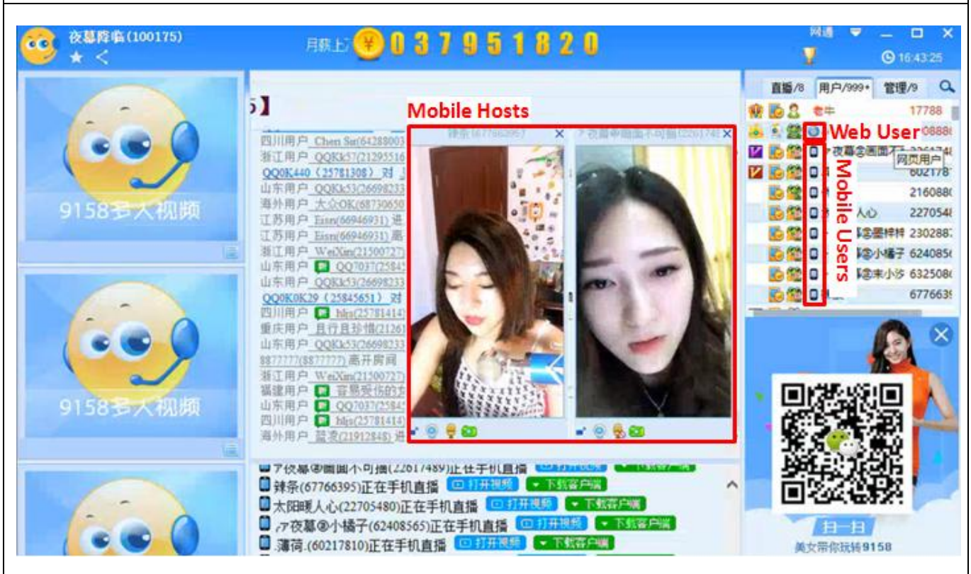
Exhibit 2 – Client Software shows all hosts and all users